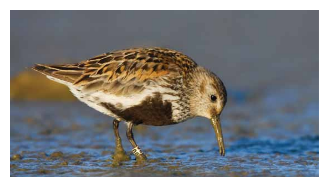
Fig. 3. Adult Dunlin observed in Poland on the bank of the Bug River near Cupel with colour ring partly coated by mud.