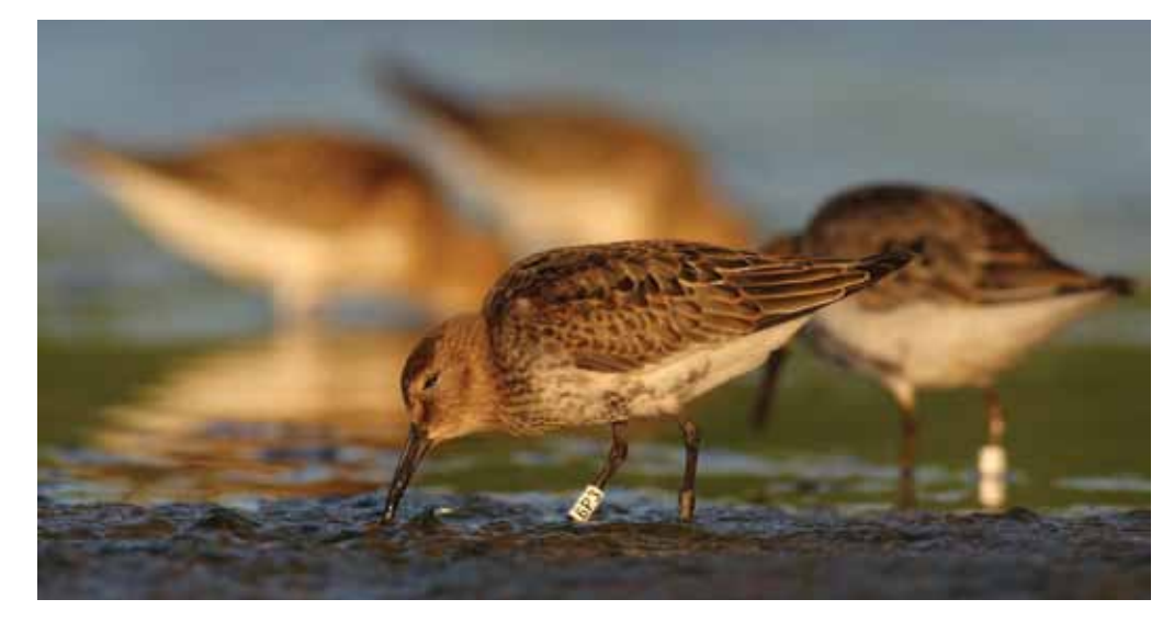
Fig. 2. Adult Dunlin with 6P3 colour ring at Vistula River mouth, Poland.